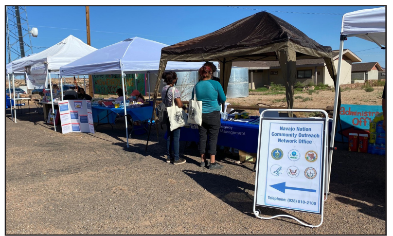
The multi-agency Community Outreach Network booths outside the Cameron Chapter House at the Uranium 101 workshop.