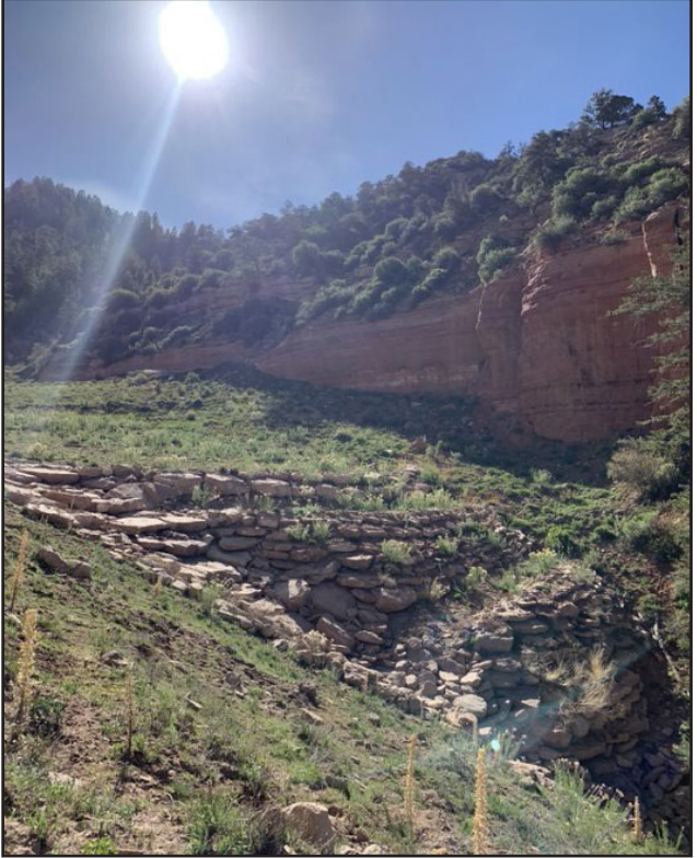
View of the Lukachukai Mountains.