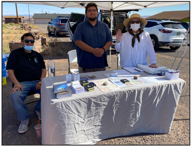
The NNEPA booth at the Uranium 101 workshop.

In 2022, the Agency for Toxic Substances and Disease Registry (ATSDR) led a multiagency workshop in Cameron, Arizona, titled Uranium 101 to educate communities on abandoned uranium mines and the health effects of exposure to radiation. Ten federal and Navajo government agencies led these outreach efforts. The presentation completed the pilot phase of workshop development. In December 2022, the co-chairs sent the final report and workshop materials to the Community Outreach Network. ATSDR continued to participate in the Community Outreach Network.