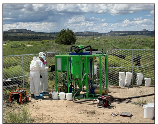
EPA ablation treatability study in progress.

EPA worked to bolster NNEPA's capacity to address abandoned uranium mines by publishing the first phase of the "Navajo Nation Capacity Building Plan: Federal Actions to Provide Workforce Development and Resources on the Navajo Nation (2022–2029)." This phase outlines focus areas where developing capacity would help to expand the role of NNEPA in overseeing and assessing the cleanup of abandoned uranium mines. EPA also coordinated two Intergovernmental Personnel Act positions with NNEPA to help support NNEPA's oversight and assessment activities at abandoned uranium mines.