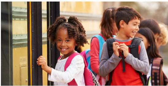
Example caption: Kids from a local school boarding our district's new electric school buses!

In December 2023, our school district received funding to purchase ten electric and five propane school buses. These zero-emission and clean school buses will result in cleaner and healthier air for all of us. And because our school is in a rural area, we were considered prioritized and received higher levels of funding. We also used EPA Clean School Bus Program funding to install the infrastructure required to charge the electric buses and have experienced a smooth transition so far. EPA provided us with valuable resources for this transition, including help preparing for our meeting with the electric utility to discuss infrastructure needs, information on additional funding opportunities, and guidance on estimating costs for the electric buses and charging infrastructure.