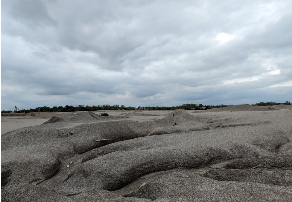
The view from the top of a chat pile at Tar Creek