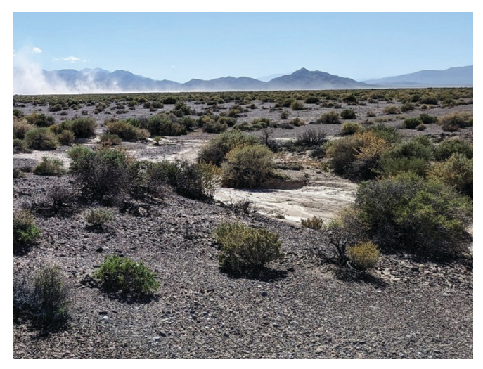
Timbisha Shoshone land

Emergency Community Water Assistance Grants Webpage