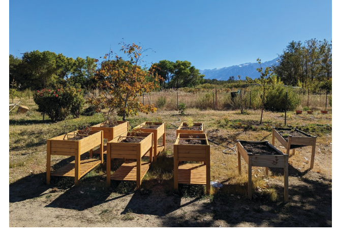
Fort Independence Community Garden

In October 2023, EPA announced a strategic plan to ensure that its assessments of pesticides more closely, quickly, and effectively evaluate the potential for endocrine effects in humans. These strategies will also improve EPA's ability to protect against those effects as part of its pesticide decisions under the Federal Insecticide, Fungicide, and Rodenticide Act (FIFRA) and to implement the Endocrine Disruptor Screening Program (EDSP) under section 408(p) of the Federal Food, Drug, and Cosmetic Act (FFDCA).