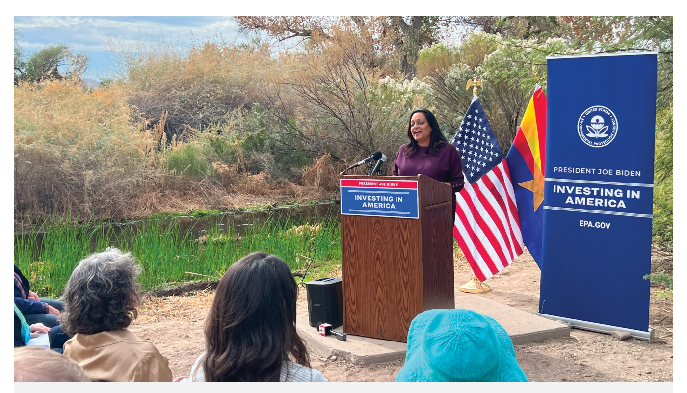
The Bipartisan Infrastructure Law provides $10 billion to address PFAS and other emerging contaminants in water. Here, Assistant Administrator for Water and PFAS Executive Council co-chair Radhika Fox highlights a $30 million investment in PFAS drinking water treatment in Tucson, Arizona.

The EPA is also making significant progress to advance the methods needed to detect PFAS in water, and to build knowledge on the levels at which PFAS in surface waters may harm aquatic life and people. The EPA and the Department of Defense are in the final stages of validating a method to test for 40 PFAS in wastewater, surface water, groundwater, soil, biosolids, sediment, landfill leachate, and fish tissue. The EPA expects to finalize EPA Method 1633 in the coming months and intends to start the rulemaking process to formally codify Method 1633 under the Clean Water Act in 2024. In the interim, the EPA recommends its use now in NPDES permits.