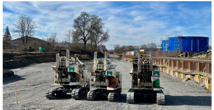
Small vehicles seen here use “direct-push” technology to advance sampling equipment underground to take samples at depth and confirm contamination has been removed