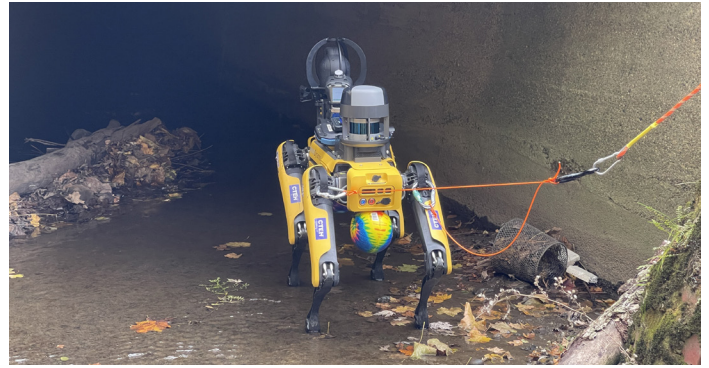
Mudge the robotic sampling “dog” entering a confined space culvert in Sulphur Run underneath East Palestine