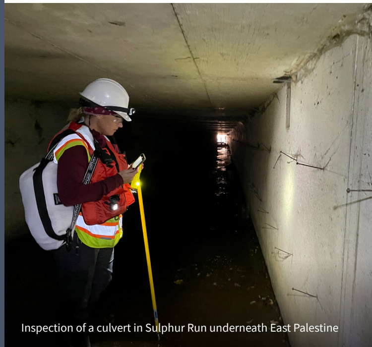
Inspection of a culvert in Sulphur Run underneath East Palestine