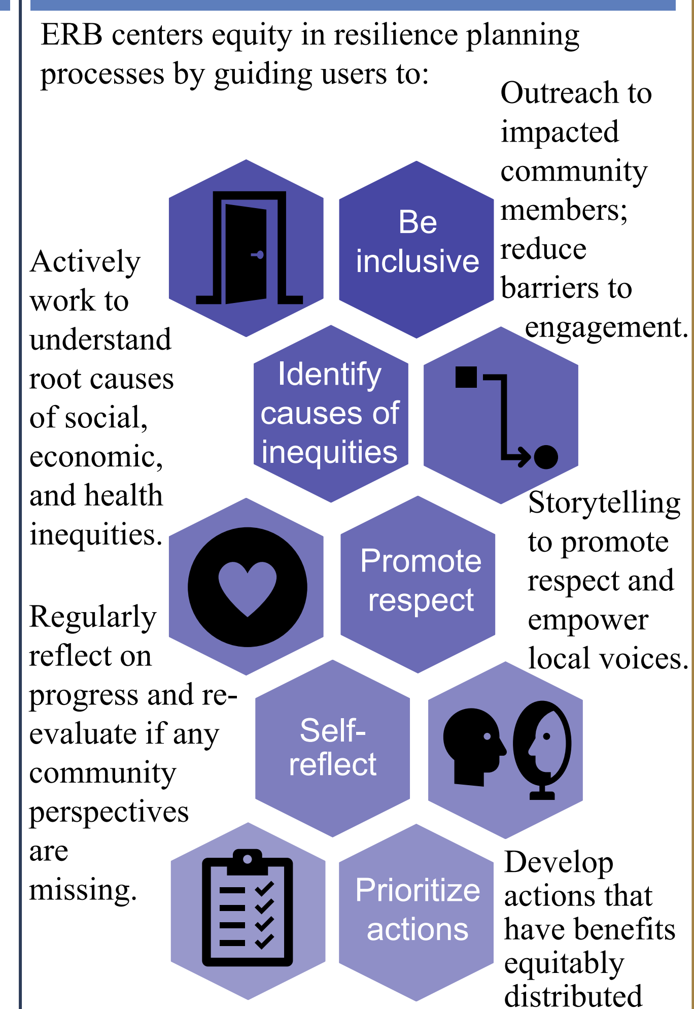
Figure 3. Ways that ERB centers equity.