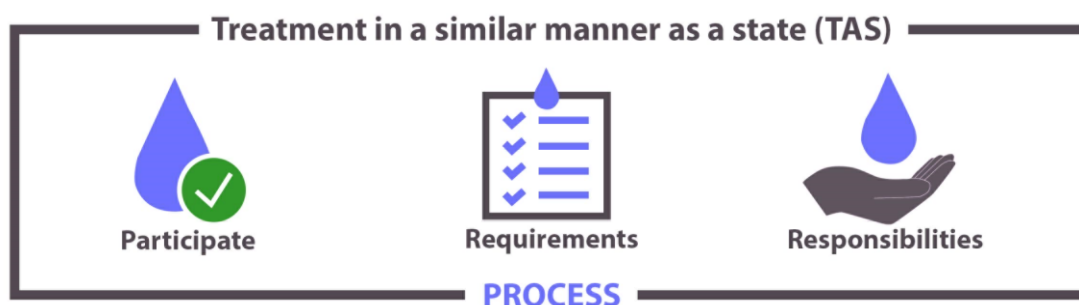
Figure 1. Treatment in a similar manner as a state (TAS) for the section 401(a)(2) process starts with the interest of a Tribe to participate in the certification process as a neighboring jurisdiction. Those

Once a certifying authority issues a section 401 water quality certification or waiver, a neighboring jurisdiction (which includes authorized Tribes and states) has the opportunity to provide input on the issuance of the federal license or permit if EPA determines that a discharge from the certified or waived project may affect the water quality of a neighboring jurisdiction (Figure 1). A federal license or permit may not be issued until the neighboring jurisdictions process concludes. 33 U.S.C. 1341(a)(2); 40 CFR 121.13(d).