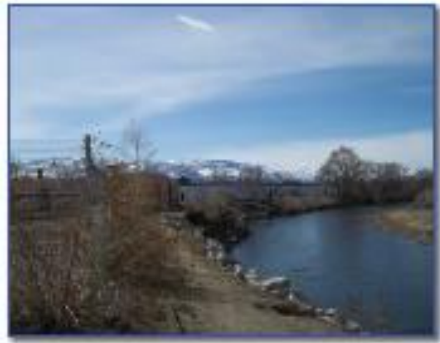
View of the Truckee River in Nevada, from parcels assessed for the Truckee River Flood Project