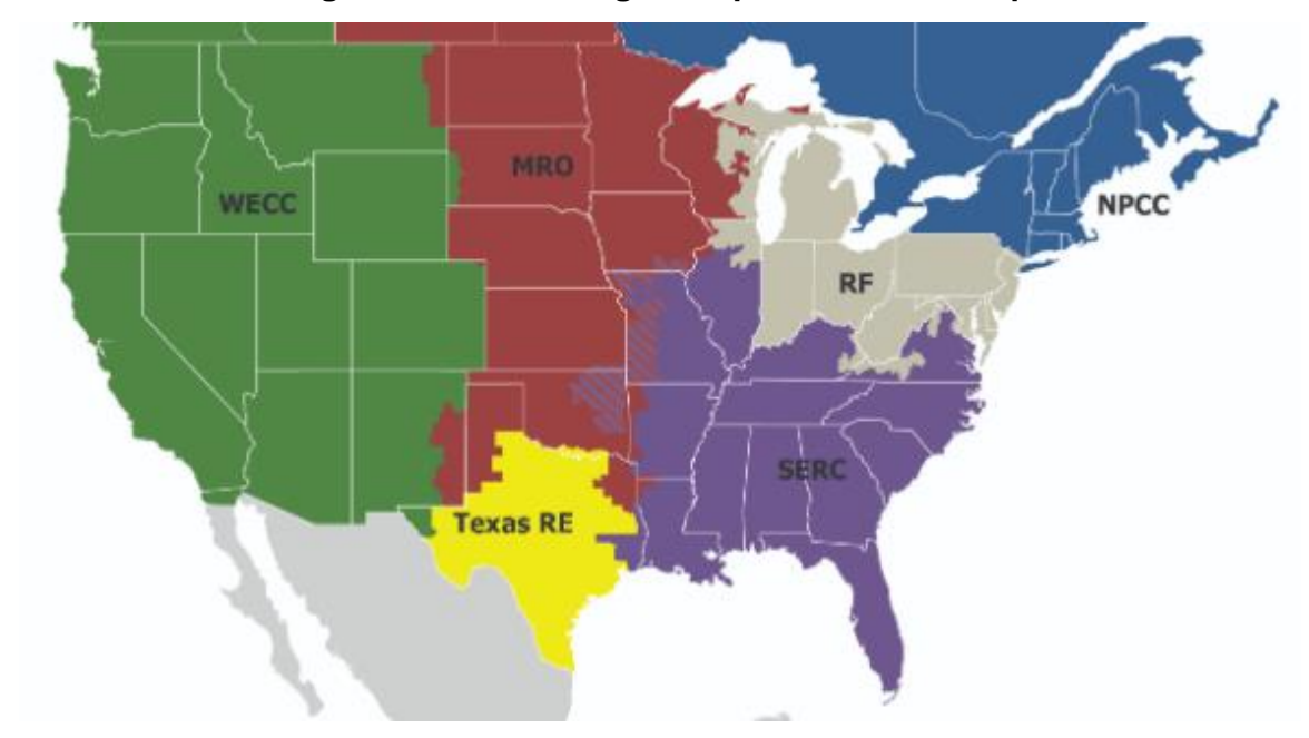
Figure B-2. NERC Region Representational Map