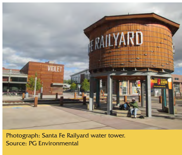
Photograph: Santa Fe Railyard water tower.

The City of Santa Fe has a successful working relationship with the MPO. Projects like the Santa Fe Railyard (pictured on right), which included improvements to the New Mexico Rail Runner Express, were planned with the assistance of the MPO and have stimulated economic growth in Santa Fe. Looking toward the future, the MPO has expressed interest in helping the city accomplish its environmental sustainability goals, including in relation to long-term stormwater planning.