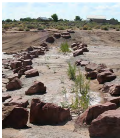
Figure B-3. Grade control structure in the Lower Montoyas arroyo incorporating planting strip.

By designing multifunctional projects, SSCAFCA has also been able to secure funds under FHWA's TAP , which supports smaller-scale transportation projects such as pedestrian and bicycle facilities and recreational trails. Specifically, it has submitted trails/outdoor access projects that include drainage protection elements. For example, SSCAFCA was able to incorporate erosion and sediment control improvements a TAP-funded arroyo bridge crossing project.