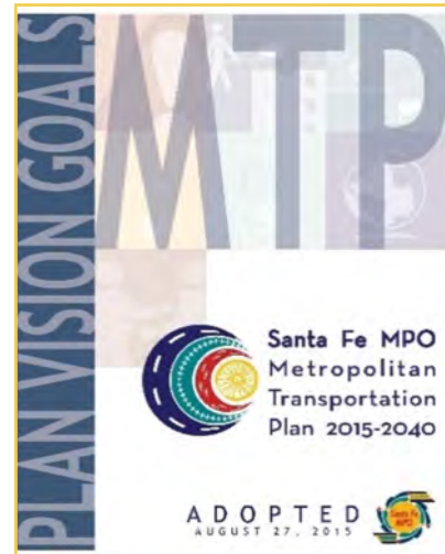
Figure A-1. Santa Fe MPO's long-term transportation project planning guide.

Santa Fe MPO receives federal funds channeled through NMDOT for program administration, data collection, and planning. Due to its small size, it does not receive a sub-allocation of funds to program transportation improvement projects for its member agencies. However, the MPO does support planning for member-sponsored projects that are either federally funded or regionally significant.