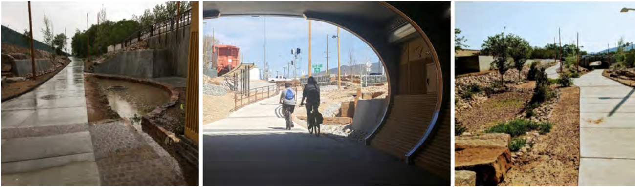
The completed Acequia Trail Underpass project.

While the funding mechanism for the underpass project did not specifically highlight stormwater components, the city integrated these elements into the construction plan. For example, it conducted a detailed hydrologic study and hydraulic analysis to ensure offsite flows did not enter the Acequia Madre. Additionally, the project's hardscape and landscape plan included LID drainage features for stormwater management. The project also included several geomorphic and LID features to reduce runoff and erosion, maximize infiltration, and slow down water flow. For example, berms, mounds, knolls and swales route stormwater through the landscape into percolation trenches and infiltration ponds. Since the underpass creates an artificial depression, stormwater overflow from ponds is collected in a 15,000-gallon cistern and slowly discharged to the aquifer to prevent flooding. On-site and off-site drainage systems were also designed to accommodate a 100-year storm. Because these features were included in the design phase of the project, they were funded when the city received CMAQ funding. This project is a prime example of how stormwater components can be integrated into projects with funding vehicles not specifically set aside for stormwater/green infrastructure improvements.