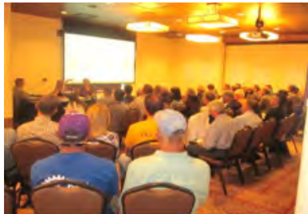
September 2017 public forum participants.

In December 2016, EPA and the City of Santa Fe began working together on an effort to determine and plan the city's long-term stormwater priorities and goals. This process included a series of meetings and conversations with city staff as well as external stakeholders to get input early on in the process that helped shape the vision of this effort. In September 2017, a core group of stakeholders consisting of EPA, City of Santa Fe municipal staff and contractors, and the New Mexico Environment Department (NMED) met to discuss objectives and priorities for the city's long-term stormwater planning effort. Participants engaged in site visits and a tour that highlighted Santa Fe's stormwater challenges and opportunities. The city and EPA also hosted a public forum where members of the community were invited to provide input to shape Santa Fe's long-term stormwater planning goals. An additional meeting was held with representatives from various city departments to discuss Santa Fe's stormwater-related challenges, discuss a long-term stormwater vision, and begin developing long-term goals.