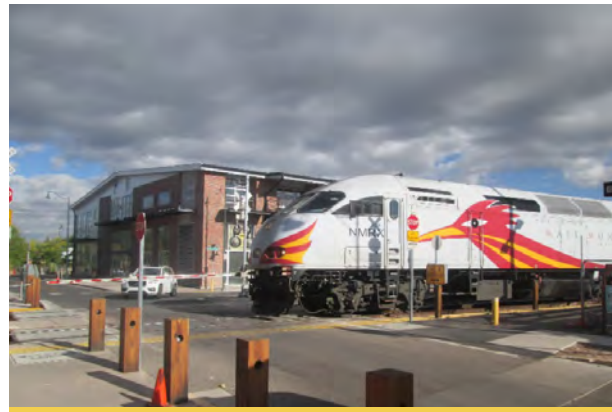
The New Mexico Rail Runner Express passing through the Santa Fe Railyard area.

SSCAFCA is another government agency near Santa Fe that routinely applies for and is awarded funding through government programs. SSCAFCA has knowledge of the planning and application process involved in pursuing government funding (particularly for funding arroyo-related projects through FEMA). Engaging with SSCAFCA can continue to inform the city while navigating these processes. Appendix B is a case study with further details on the SSCAFCA organization.