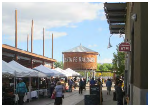
The Santa Fe Railyard was a collaborative city project with several stormwater management features.