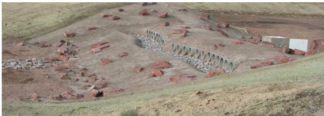
Flooding and floatable controls installed as part of SSCAFCA's Lower Montoyas project.

—PISCES Recognition Program: 2017 Compendium (EPA, 2017c)