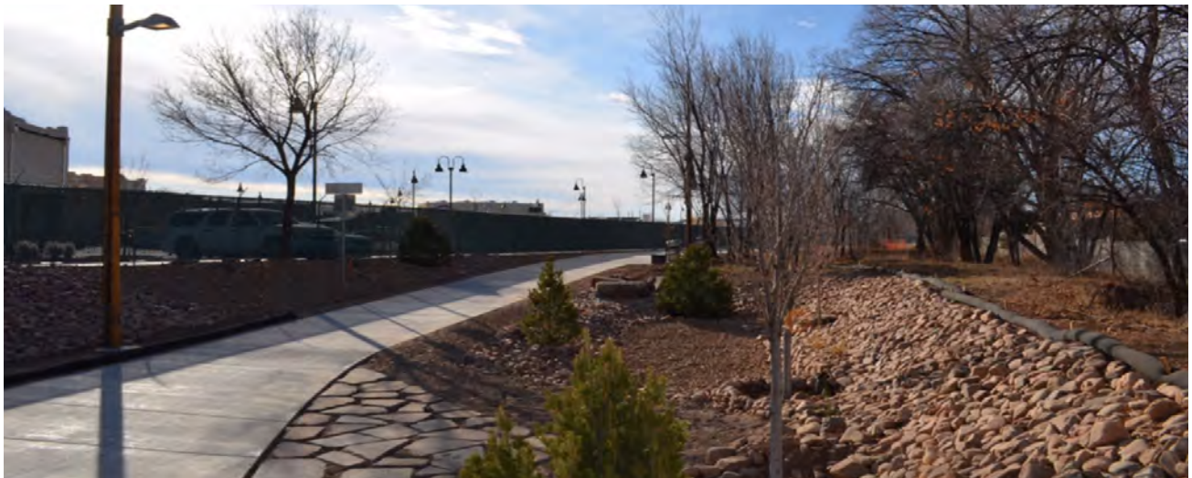
Stormwater swale installed as part of the Acequia Trail Underpass project.

The Acequia Trail Underpass 9 project was completed in 2017 and was funded through FHWA's Congestion Mitigation and Air Quality Improvement Program (CMAQ). The project's total funding was $4,290,463, including over $600,000 of local matching funds. The project involved constructing a path under St. Francis Drive, one of the busiest intersections in the city, giving cyclists and pedestrians a safer connection between southwest Santa Fe and the popular Santa Fe Railyard area. The Acequia Trail is one of four major trail corridors in Santa Fe and has an average of 358 users a day. Before construction, trail users crossed the intersection at St. Francis Drive via a signalized crosswalk. However, they often used unsafe and indirect paths to reach the crosswalk, such as crossing at unmarked mid-block locations rather than the crosswalk, jumping the road median, and not observing crosswalk countdown signals. Vehicles also failed to yield to cyclists and pedestrians at the intersection, and vehicles stopped in the crosswalk prevented safe passage.