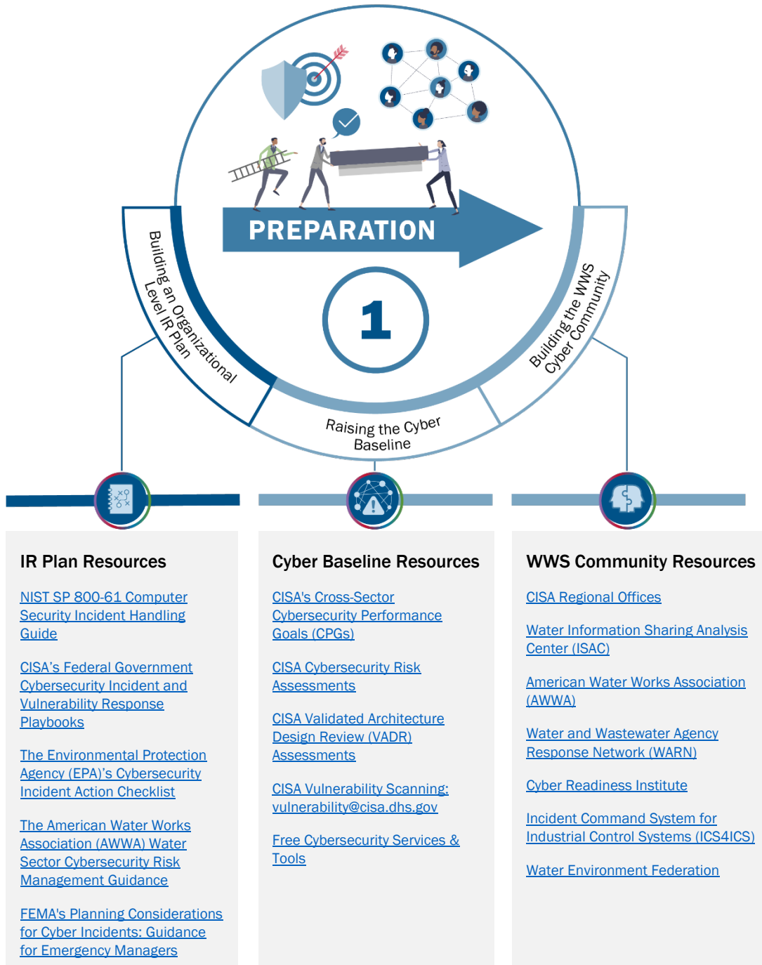
Figure 2: Preparation Phase

Preparation, illustrated in figure 2, is the first of four stages in the IR lifecycle. Preparation may seem counterintuitive for incident response. However, preparation ensures an organization is better positioned to prevent cyber incidents and reduces both the impact and the time it takes to return to normal operations. While no two utilities have the same planning considerations, simple, prioritized steps can make preparation manageable.