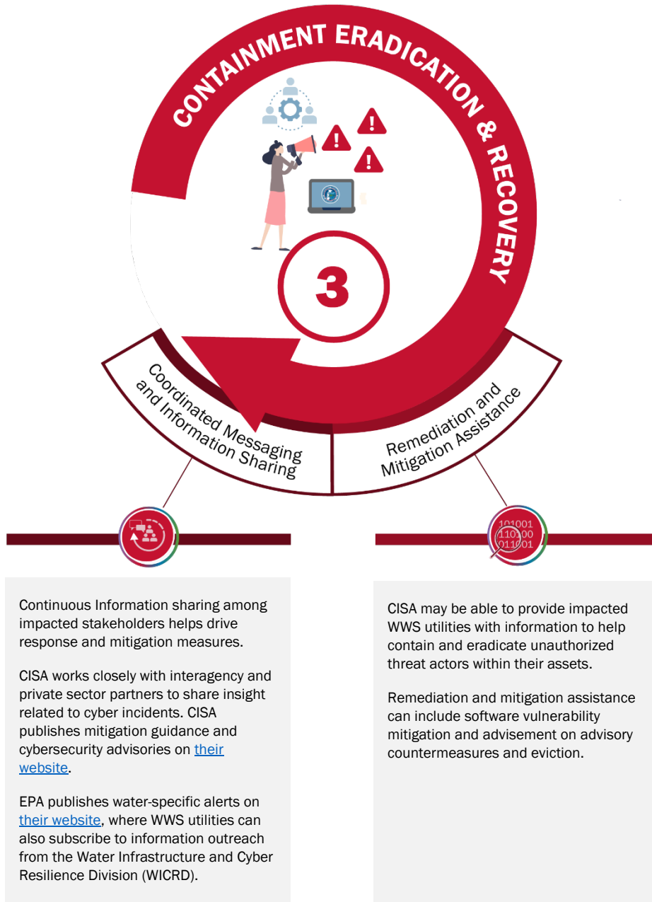
Figure 4: Containment, Eradication, and Recovery Phase

Containment, Eradication, and Recovery is the next step in the IR lifecycle. At the organizational level, WWS utilities will continue following their established IR Plans throughout the response process. At the collective level, meanwhile, partners will be focusing on ensuring a coordinated response throughout the containment, eradication, and recovery phase. Depending on the severity of the incident, partner focus may additionally be on coordinating technical analysis and support for impacted entities.