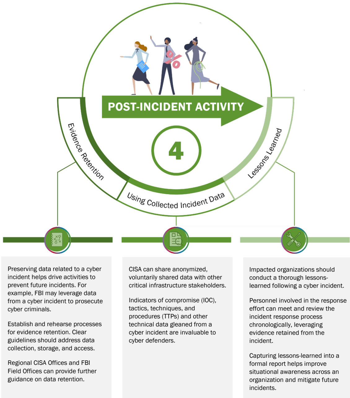
Figure 5: Post-Incident Activity

Post-Incident Activity is the last step in the IR lifecycle. At the conclusion of any cyber incident, it is important for all relevant partners to conduct a retrospective analysis of both the incident and how responders handled it. The summation of post-incident activities determines “lessons learned.”