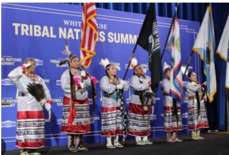
Six people across a stage at the White House Tribal Nations Summit in Tribal ceremonial dress.

At the Summit, President Biden focused on several topics, including: an online " Access to Capital Clearing-house " that will serve as a searchable repository for an up-to-date list of all federal funding opportunities available to Tribal Nations and Native businesses; the release of the Sacred Sites " Best Practices Guide for Federal Agencies Regarding Tribal and Native Hawaiian Sacred Sites ," which provides best practices, procedures and guidance for the management, treatment and protection of sacred sites; and a new Executive Order to reform the federal funding system for Tribes, entitled Reforming Federal Funding and Support for Tribal Nations to Better Embrace Our Trust Responsibilities and Promote the Next Era of Tribal Self-Determination (fact sheet here ).