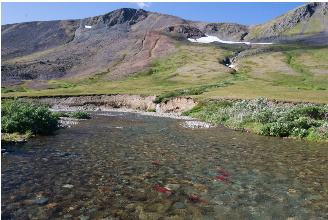
Salmon in a backcountry stream, Katmai Preserve

Through our joint efforts, EPN is now working directly with over 20 Tribes on their unique climate and environmental needs. The bulk of this assistance is currently focused on grants, from application reviews to implementation assistance. In addition to working with AIEO, EPN will be involved with the Environmental Justice Thriving Communities Technical Assistance Centers (EJ TCTACs) recently selected by EPA and the Department of Energy . This will be an excellent opportunity to apply the experience they've gained from working with AIEO to a broader audience with the EJ TCTACs.