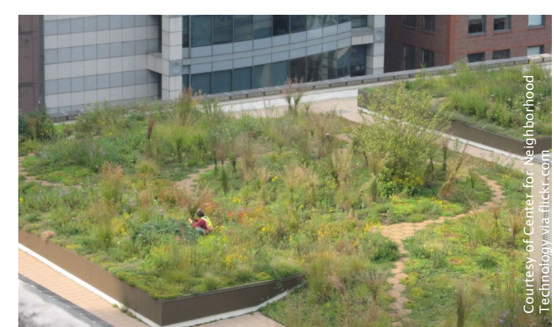
Exhibit 5. Green roof on City Hall, Chicago, Illinois. The city of Chicago created a green roof on its city hall to test the performance of the technology and understand how green roofs could help the city achieve its climate action goals. The roof can be as much as 30 degrees cooler than surrounding roofs in the summer. It reduces the use of air conditioning in the building while absorbing rainfall that would otherwise run into storm sewers.

Recognizing such benefits, the city of Chicago's Climate Action Plan calls for 6,000 new green roofs, more than a million new trees, a watershed plan that factors in changes expected due to climate change, and other actions. 12 In the first two years after implementation, more than 4 million square feet of green roofs were completed or planned, and 32,000 square feet of Chicago alleyways were reconstructed with permeable materials. 13