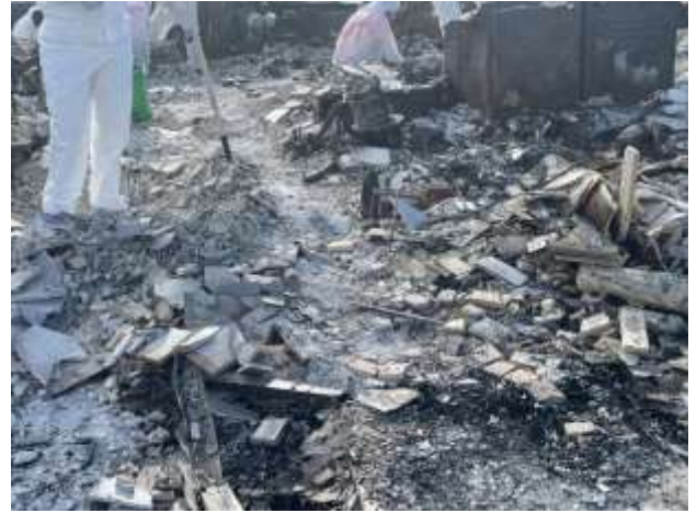
One photo of crews on one burned property aftah dey wen put da Soiltac; floating ash no longer stay visible.