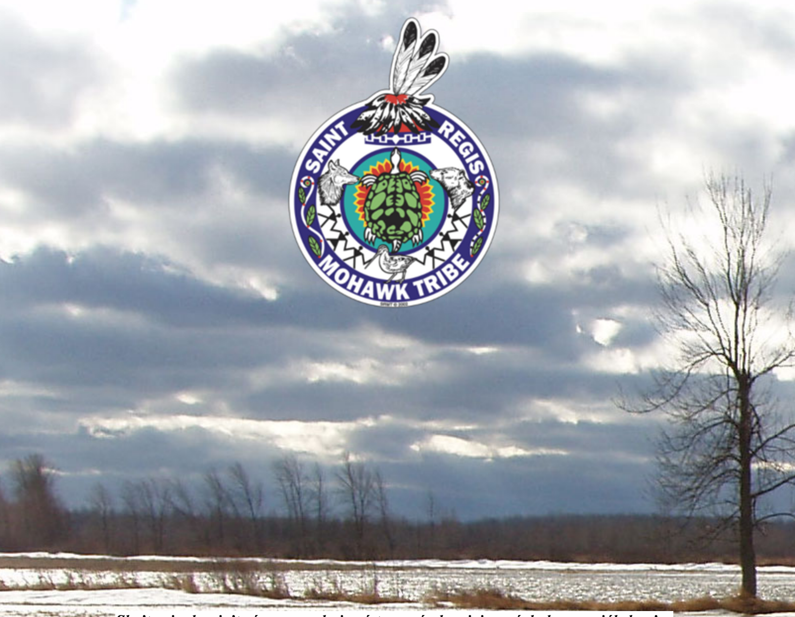
Ska'tne ionkwaio'te ón:wa wenhniserá:te ne sén:ha aioianerénhake ne enióhrhen'ne WORKING TOGETHER TODAY TO BUILD A BETTER TOMORROW