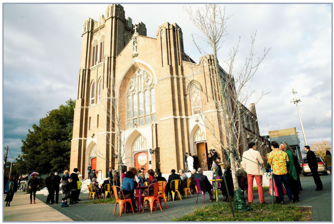
Former St. Rose de Lima Church is now the Southern Rep Theatre.