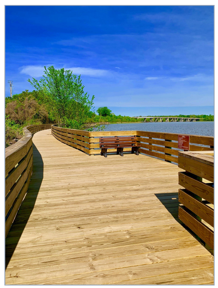
Portion of the Hopewell Riverwalk trail.

VIRGIN ISLANDS – To operate and expand its brownfields program, the Virgin Islands (VI) continues to make progress to establish a Voluntary Cleanup Program (VCP), which will address the cleanup and/or redevelopment of brownfields within the VI. The VCP will return brownfields to useable conditions. Cleanup will be performed under a new memorandum of agreement created between the Department of Planning and Natural Resources Division of Environmental Protection (DPNR-DEP) and the participant. Following the enactment of the Virgin Islands Brownfield Revitalization and Environmental Restoration Act in 2008, the program is finalizing the signatures for the promulgation of its final drafted rules and regulations. DPNR-DEP used its Section 128(a) Response Program funding to inventory 141 properties and assessed 20 properties. Currently, the program is working to hire a professional services contractor to assist the division with conducting Phase I and Phase II environmental assessments.