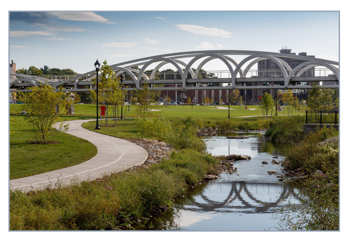
Meriden Green public park.

EPA Funding Provided to States and Tribes to Address Contaminated Land in their Communities