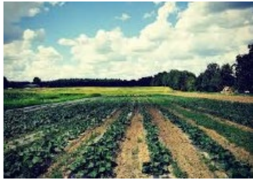
Wholesome Valley Farms— Berino, New Mexico