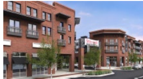
The Steelyard—Oklahoma City, Oklahoma