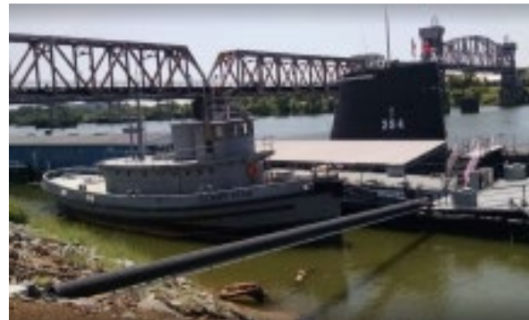
USS Hoga— Little Rock, Arkansas