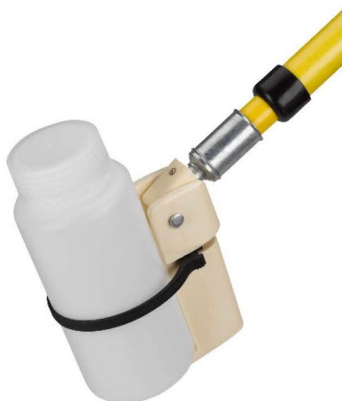
Figure 1: Illustration of in-pipe grab sample collection technique by pole sampling.

2. Water samples are collected at approximately one foot below the surface or mid-depth when flow is shallow (Figure 1) or directly from the outfall if possible. For in-pipe grab sampling, hold the bottle near the base and plunge, neck downward, below the water surface (~12 inches if possible). When using a bottle gripping pole sampler, keep the bottle turned down, if possible, but do not submerge it to the invert. Turn bottle until neck points slightly upward and mouth is directed toward the current. If there is no current, create a current artificially by pushing bottle forward horizontally in a direction away from the hand (be careful to minimize sediment suspension during sampling).