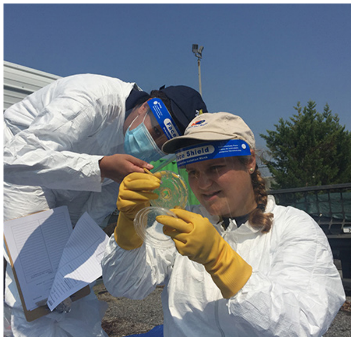
Volunteers inspect marine debris in Hudson River Park, New York City

Plant community orchards, engage volunteers and provide environmental education at locations along the Blue River watershed in urban Kansas City, Missouri. Project will: 1) plant a 35-tree orchard on Kansas City's historic Municipal Farms site; 2) plant a 32-tree expansion to the Kauffman Legacy Park Orchard; and 3) engage students in the Kansas City Community Garden Demonstration Orchard through STEM-based lessons on environment and nutrition.