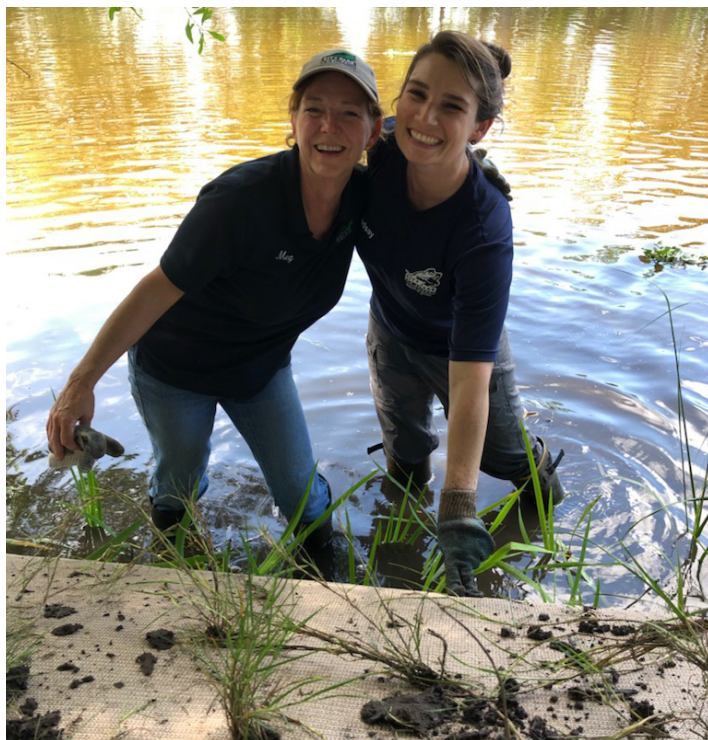
Crew members plant shoreline grasses in New Orleans, LA