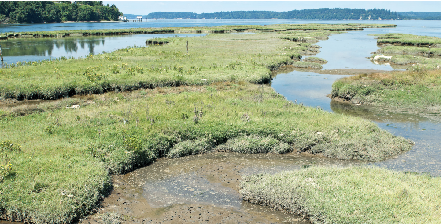
Nisqually Delta, Washington