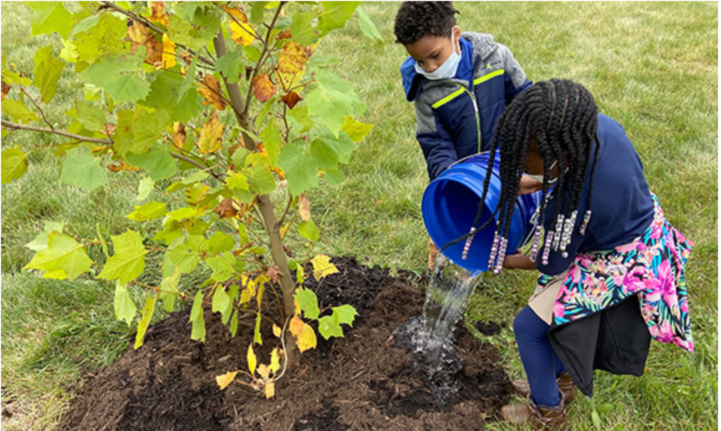
Students maintain a newly planted tree in Chicago