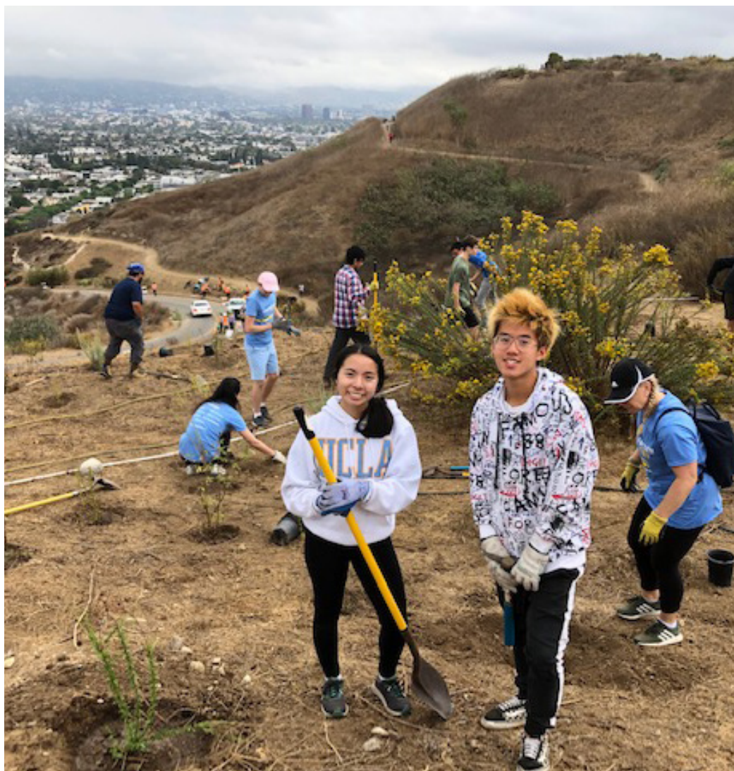
Volunteers plant trees in Los Angeles, CA

1133 15th Street, NW Suite 1000 Washington, D.C., 20005 202-857-0166