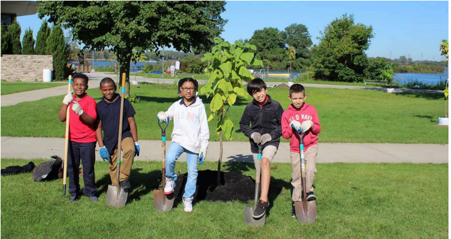
Students plant a tree in the Michigan Lake watershed in Indiana