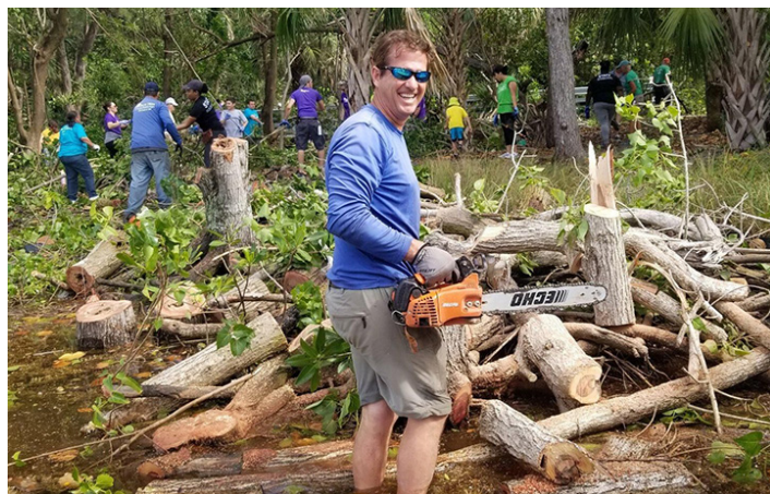
Volunteers restore coastal mangrove habitat in Miami, FL

Engage volunteers, Conservation Corps members, and high school students to restore 38 acres of habitat for birds, amphibians, and native plants at Possum Hollow Woods forest preserve. Project will improve regional water quality, plant native seeds, increase habitat for rare species through