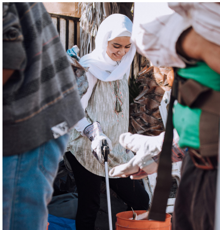
Volunteers remove debris from a beach in San Diego, CA.

Clear 10.4 acres of invasive vegetation and install 3,000 native plants in Kawainui Marsh, involving 1,600 volunteers and 2,300 K-12 students. Project will restore 1.3 wetland acres and 2.5 upland acres to create habitat for three species of endangered waterbirds and begin the transition to a community-based management model for parts of Kawainui Marsh.