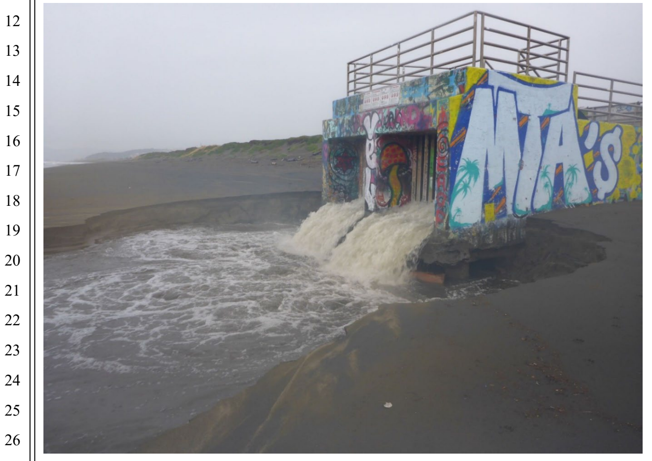
Figure 2: Photo of CSD-002 on Ocean Beach taken by EPA representative, December 20, 2023

156. The permanent signs affixed to these CSO outfalls are not visible or legible from 50 feet both onshore and offshore, as required by the 2019 Oceanside Permit. The signs are small and, in some cases, are affixed to the outfall in such a way that persons cannot read the text.