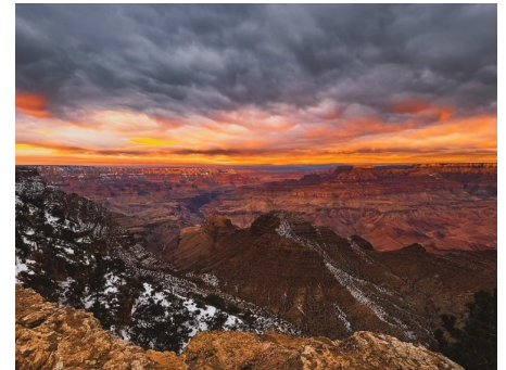
Southeastern edge of the Grand Canyon.

EPA is hosting the second Clean Water Act (CWA) Tribal Forum in person on May 14-15, 2024 in Washington, DC. The forum will focus on a more advanced understanding of the CWA authorities most relevant to Tribes and implementation of those authorities in Indian country. This event is intended for Tribes with experience administering water quality programs who are interested in taking a deeper dive with CWA implementation to discuss challenges, benefits, and available tools.