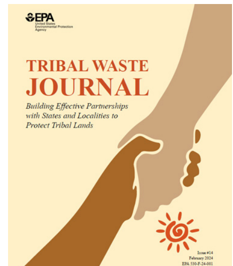
Cover of Tribal Waste Journal Issue 14: Building Effective Partnerships with States and Localities to Protect Tribal Lands