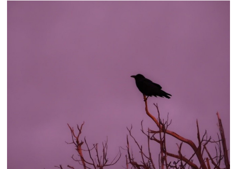
Bird perched on a branch on the southeastern edge of the Grand Canyon.