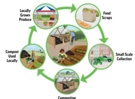
Closed Loop Composting