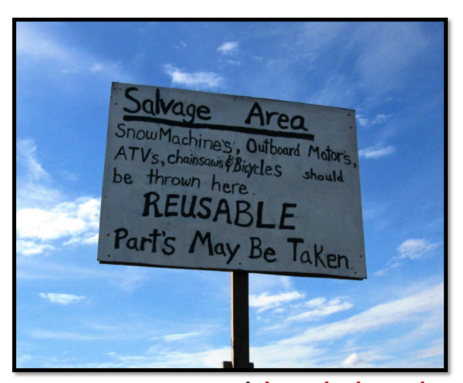
Put reuse and back-haul items by their signs at the dump