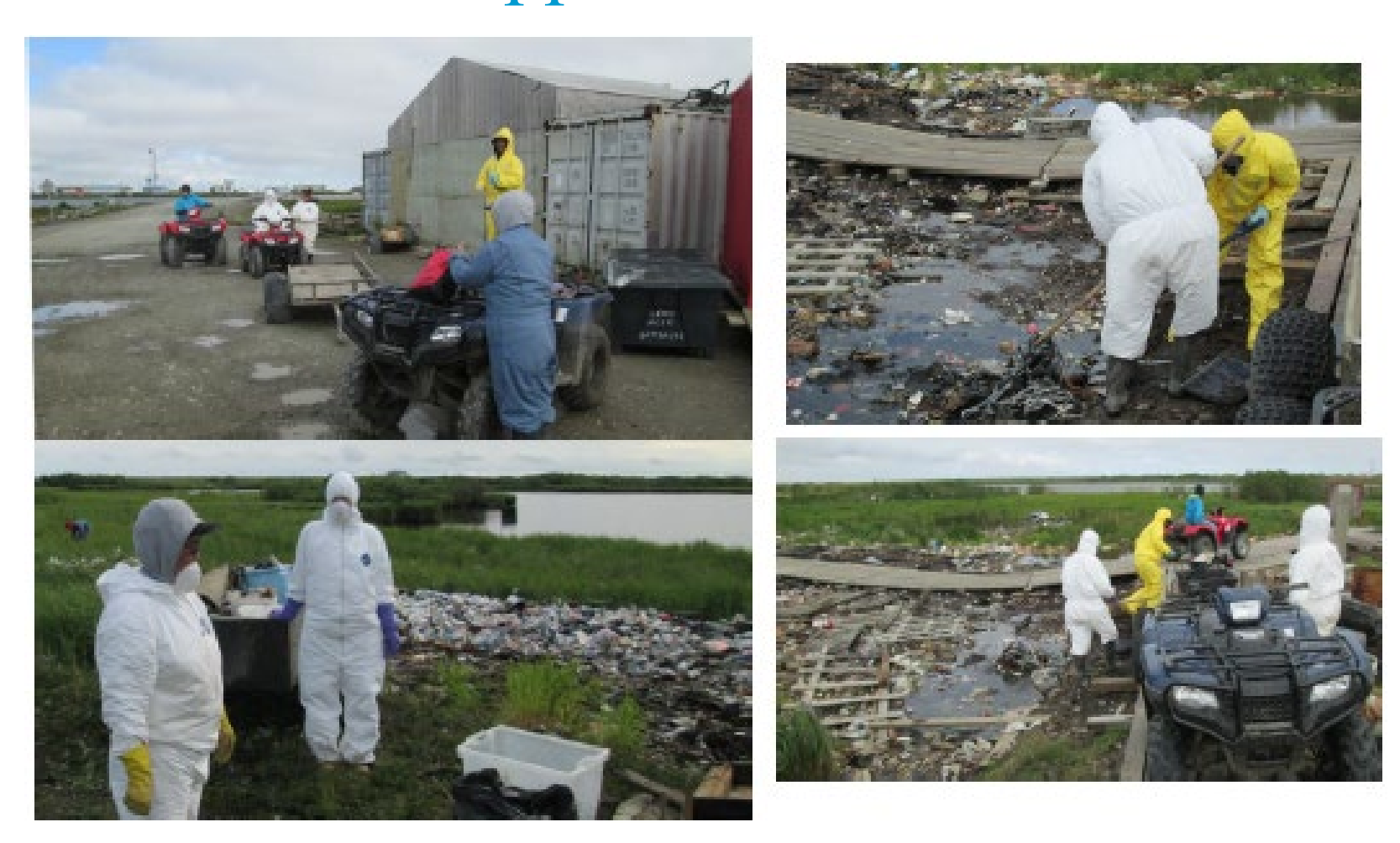
People went to work!