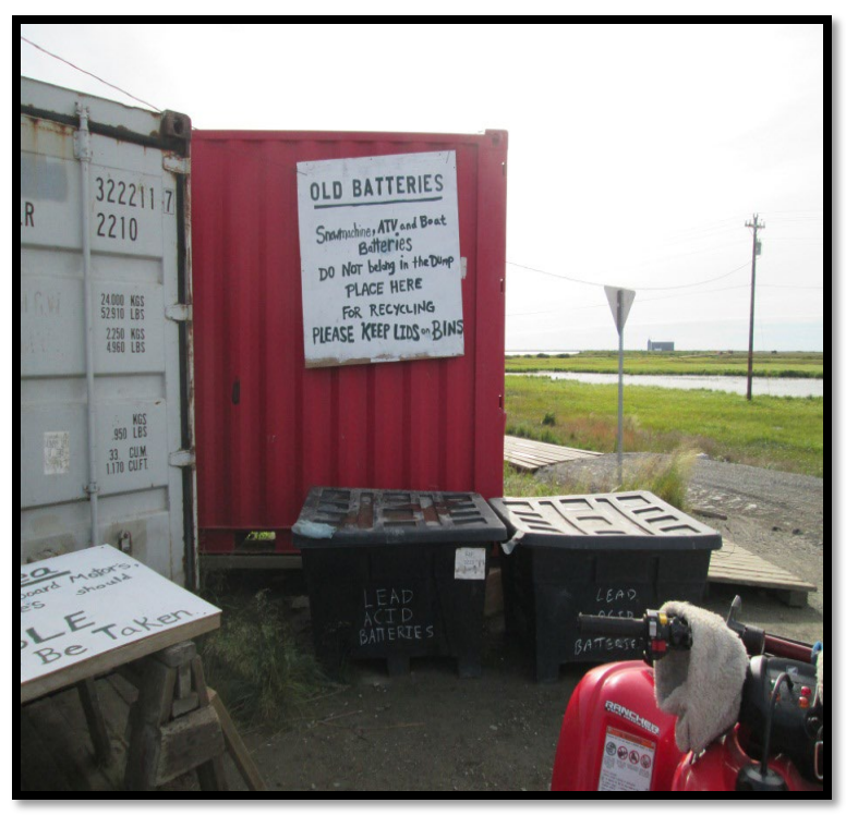
Put used Batteries in the bins by Code Red

And put used Oil in the containers at the Tank Farm