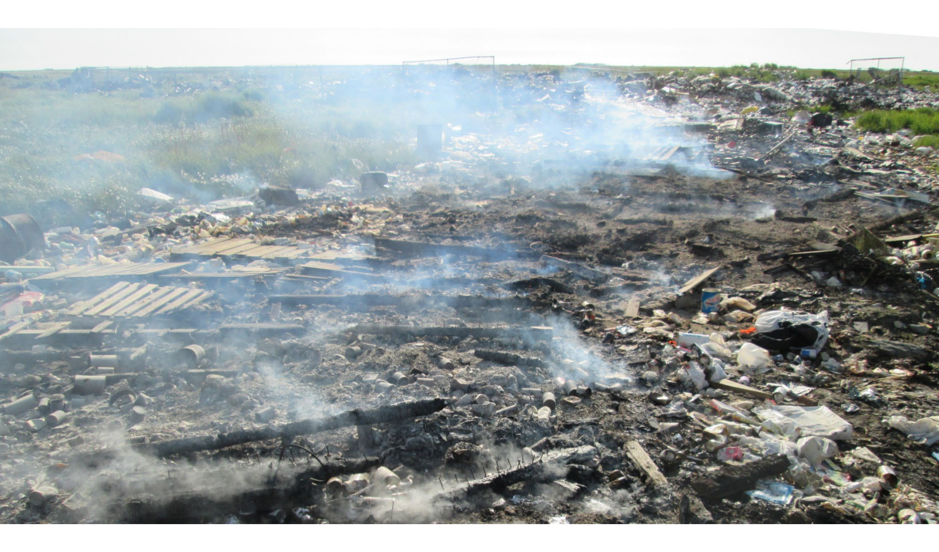
Trash fires got out of control!