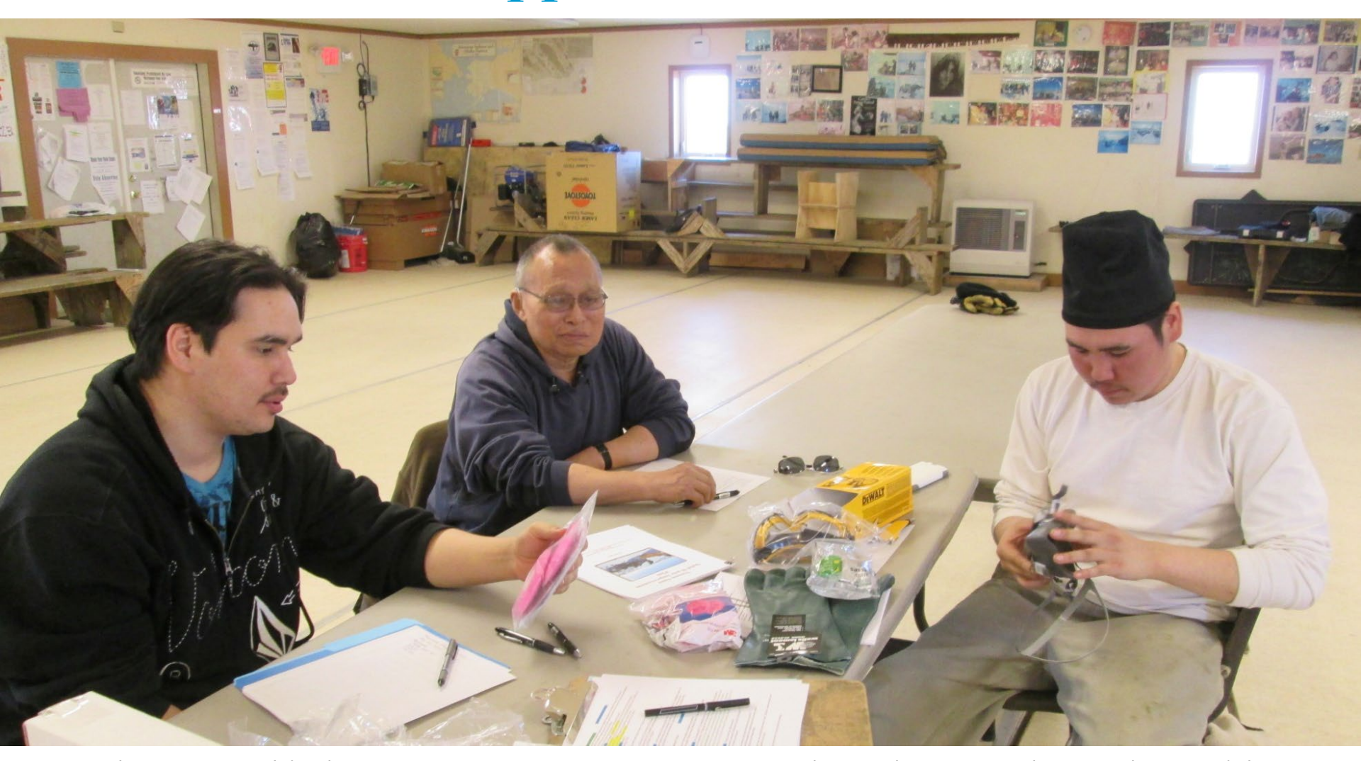
The Solid Waste Team worked on the details.