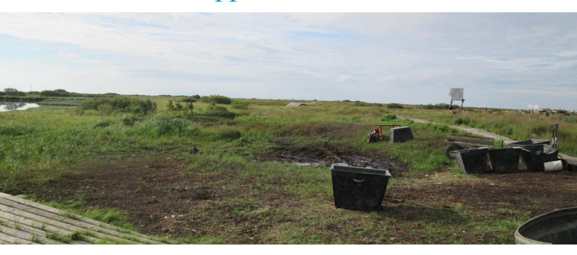
The land outside the dump fence was cleaned!