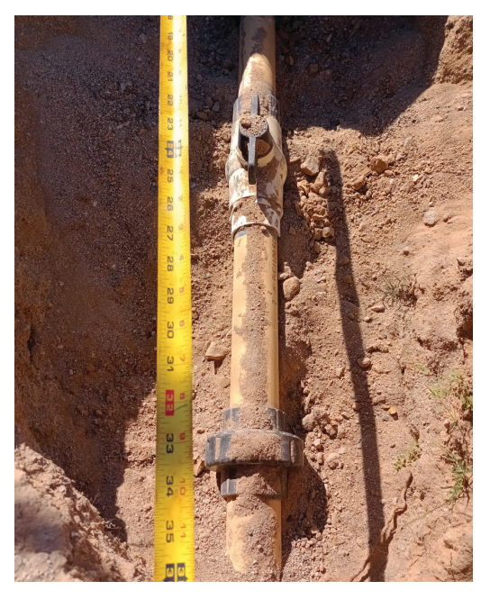
Potholing is an excavation method that involves digging small holes to identify the location, depth, and type of underground service lines.

This fact sheet describes these services, outlines eligibility, and provides steps for submitting a request to EPA.