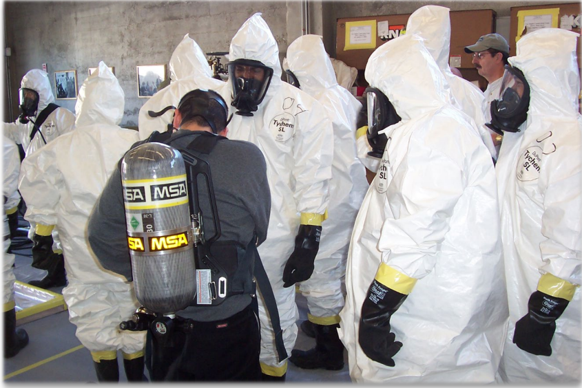
Region 9- Job Training class, Los Angeles Conservation Corps

Note: Section I.C. of the grant guidelines provides a list of additional types of direct programmatic costs associated with implementing a Brownfields Job Training program.