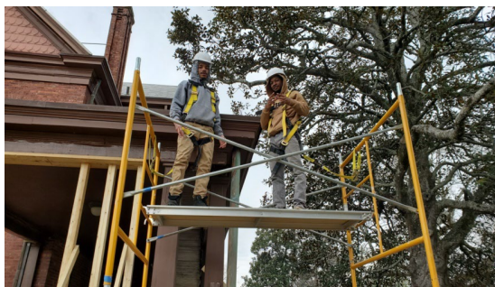
Student receiving additional training from Groundwork USA in Tuskegee, AL

Out of a total of 19 graduates from the Dads job training program since 2018, 16 completed Groundwork RI’s training portion including OSHA Health and Safety, and 11 have found employment. The Dads have been employed by Children’s Friend in its facilities department and by Groundwork RI on its GroundCorp landscaping team. Graduates have also been employed by RI Hospital, TPI Composites building wind turbine blades, Pathfinder Tree Service in Massachusetts, J&D Landscaping and Lawn Care, Robert Alan Matthews Garden Design, and more.