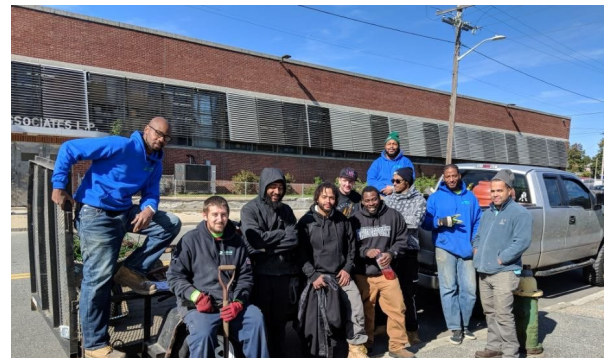
Fall 2018 Graduates with Groundwork RI GroundCorp staff

Groundwork RI's partnership with Children's Friend is an example of the kinds of strong partnerships Groundwork RI nurtures within its job training program. Children's Friend improves the well-being and health of Rhode Island's most vulnerable children and their families. Aware that fathers of children in its Head Start program need better jobs and job training, Children's Friend created a paid job training program specifically for this group. The organization works under the belief that fathers who participate in the job training program will also improve the role they play in their children's lives. To this end, Children's Friend provides workshops such as, "A Father's Impact on Child Development", "Helping Your Child Succeed in School and in Life", and "Parenting - A Father's Role."