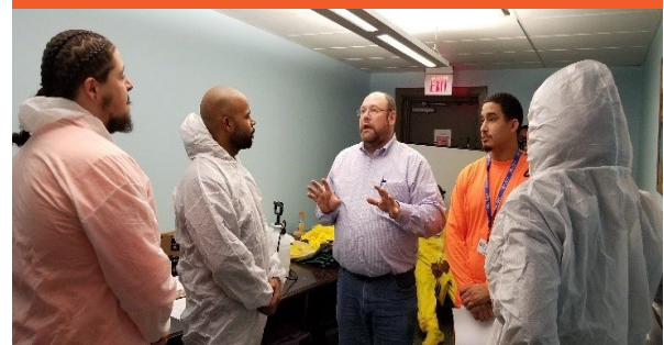
HAZWOPER Training

Javon and Tetee's Story - https://vimeo.com/402875451