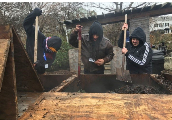
Composting Exercise

“Partnering with Children’s Friend has been amazing. We are reaching the exact population we want to be reaching and introducing the Dads to careers and job opportunities most never even realized were possibilities. We love the holistic approach the Dads program takes, taking into consideration the whole person and their families.”