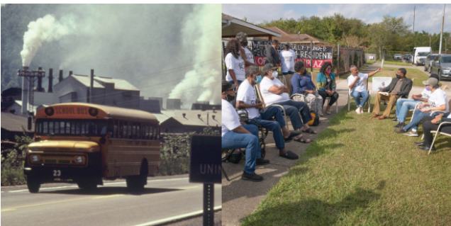
Prioritizing communities with multiple stressors.