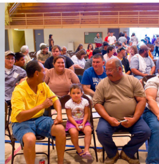
EPA outreach meeting after Hurricane Katrina.

EPA Administrator Michael S. Regan with community members from Mossville, Louisiana.