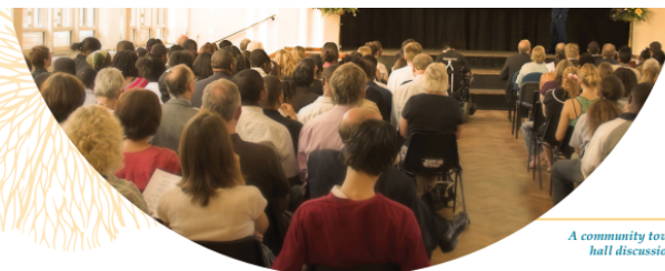
A community town hall discussion.