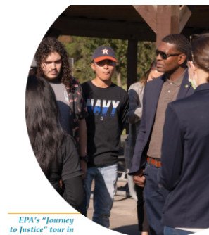
EPA's "Journey to Justice" tour in Houston, Texas.