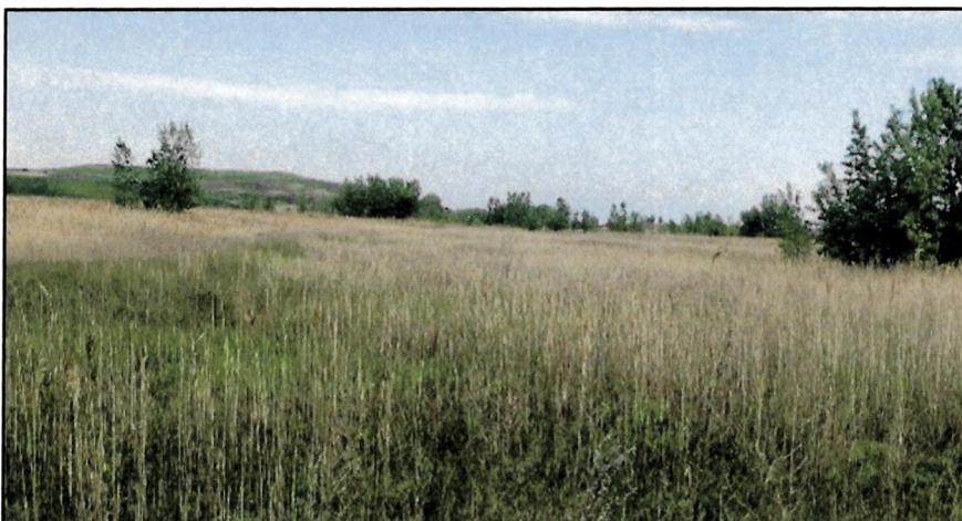
View of the Lake Calumet Cluster site from southern property boundary.

www.epa.gov/superfund/lake-calumet-cluster