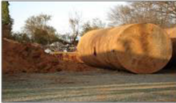
Removal of 20,000 gallon Underground Storage Tanks Leaking Cancer Causing Petroleum (1/15/08)