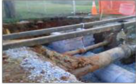
Repair of City of Mebane Sewer and Water lines leaking into Stream at City Park (Feb. 2007)