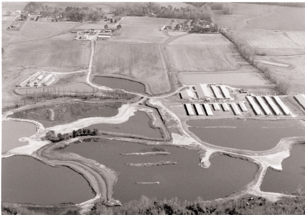
Figure 1. Confined animal feeding operations in eastern North Carolina showing fecal waste pits in the foreground, confinement structures (left and right middle), spray fields, and neighboring homes.

Noxious odors—so severe that residents who can afford it sometimes leave their homes to spend especially bad nights in