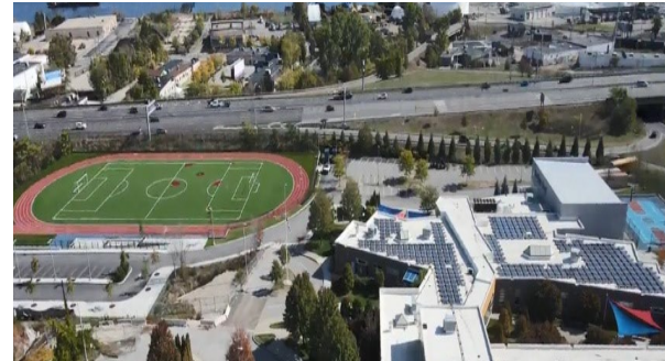
Meeting Street educational center buildings and athletic fields seen from above

A $200,000 EPA cleanup grant in 2004 funded the cleanup that led to Meeting Street opening the new campus in 2006. To continue with ambitious efforts to expand, Meeting Street applied for and received three additional cleanup grants totaling $600,000 in 2018. They were also successful in competing for funds at the state level, winning a total of $1.2 million in funding through Rhode Island's Brownfield Bond Fund and the Brownfields Remediation and Economic Development Fund. These funds paid to clean up three blighted industrial lots associated with a former metal plating business and automotive junkyard and repair shop. Meeting Street then expanded its parking and athletic facilities onto these properties, adding a new outdoor track and a multi-sport artificial turf field that completed the second step in its four-part master expansion plan.