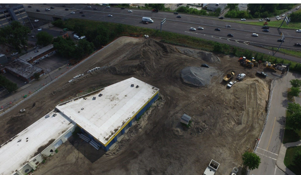
Cleanup in progress, seen from above

“The EPA Region 1 team has been an invaluable partner in Meeting Street’s 15-year journey to productively reuse brownfields across Lower South Providence. Our work to be a community resource for families, supporting the healthy development and education of all children, has been made possible by the EPA Brownfields program, and their collaboration with the RI Department of Environmental Management.”