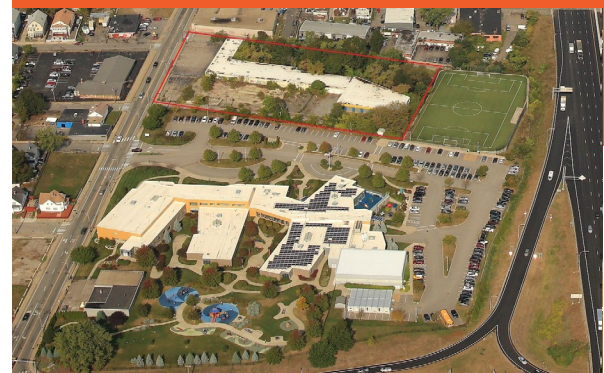
Meeting Street campus before cleanup and redevelopment

Former Uses: Residential, Furniture Warehouse, Automobile Service Facility, Metal Plating Business