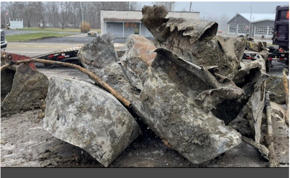
Several removed USTs are salvaged and processed for recycling.

The grant was a great benefit to us as it turned a once vacant garage into a property that could be used again. Since the work was completed the garage and lot not only look better but also now employ three full time employees year-round.