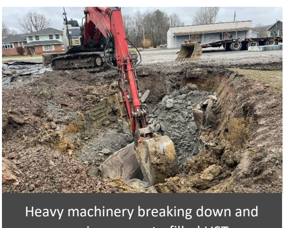
removing concrete-filled USTs.