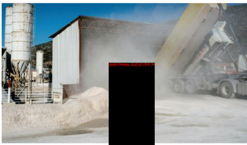
Photograph of Concrete Batch Plant Operating in Houston

The concrete production process causes significant air pollution in the neighborhoods where CBPs are sited. 19 CBPs are cause for heightened concerns related to coarse and fine particulate matter (specifically PM 10 and PM 2.5 ), crystalline silica, and cement dust. A primary pollutant of concern from CBPs is PM, consisting of cement, pozzolan dust, coarse aggregate, and sand dust emissions. Fugitive sources of PM from CBPs include the transfer of sand and aggregate, cement unloading to storage silos, truck loading, transfer or mixing of materials, mixer loading, vehicle traffic, and wind erosion from sand and aggregate storage piles. 20 The inhalation of these pollutants are associated with heart and lung disease, increased respiratory symptoms, and other chronic diseases. Furthermore, cement dust can be composed of many harmful constituents in undefined quantities, for example: metal oxides including calcium oxide, silicon oxide, aluminum trioxide, ferric oxide, magnesium oxide, sand and other impurities. 21 Due to the air pollution caused by CBPs, the facilities must obtain air permits from TCEQ to operate.