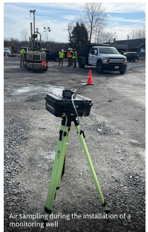
Air sampling during the installation of a monitoring well

Air monitoring and sampling has been constant since the derailment. Now that excavation is complete, Norfolk Southern will submit a proposal to reduce community and work area air monitoring and sampling. EPA will review the proposal before there is any reduction. Air sampling data can be found online: epa.gov/east-palestine-oh-train-derailment/air-sampling-data