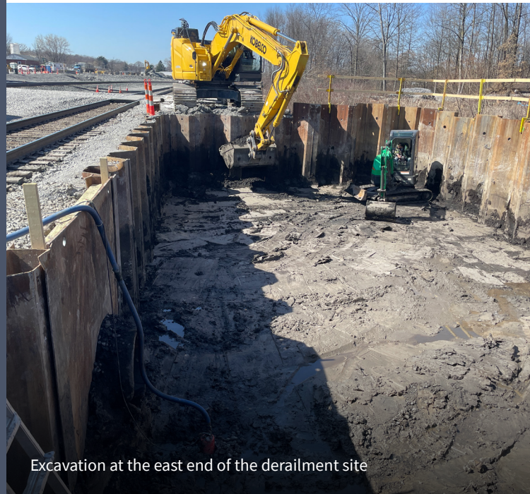
Excavation at the east end of the derailment site