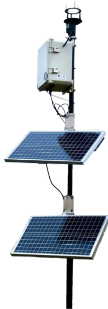
Figure 2: Canary X Device, Anemometer, and Solar Panel Mount

2.1.3 Detection and quantification of methane by the Canary X Methane Monitoring System is supported by several components, including meteorological sensors, a solar panel and battery, cellular data upload capabilities, backend quantification algorithms, and a customer dashboard with alerting and near real-time data display. These individual components function together as a complete system to gather facility-specific concentration and wind data, upload the information to a secure cloud network, and process the data for facility-level methane quantification determinations. Figure 2 shows the installation of a Canary X device, with an anemometer and solar panels mounted externally.