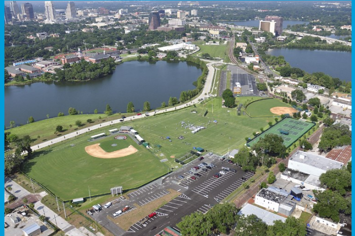
An aerial view of the recreation facilities on site.

Working relationships and innovative settlement agreements led to the cleanup of the Former Spellman Engineering site and reuse of the adjacent Lake Highland property in Orlando, Florida. In 2008, the EPA and the city of Orlando (the City) signed the nation’s first CPO agreement, in which the City agreed to voluntarily implement the site’s estimated $12.9 million remedy. Lake Highland Preparatory School (LHPS) also worked with the City to finalize the project’s Sale and Purchase agreement and with the City, the EPA and Florida Department of Environmental Protection to finalize Prospective Purchaser Agreement and Brownfield Site Rehabilitation agreements that addressed potential liability concerns and facilitated the property’s reuse. LHPS has reused part of the Lake Highland property for sports fields and parking and has plans for a gymnasium and maintenance facilities. The Dinky Line segment of the Orlando Urban Trail, a paved recreation trail, now extends through the area. Commercial and industrial businesses are located on part of the site. The City and the Orlando Utilities Commission are also exploring opportunities for mixed-use redevelopment on the property.