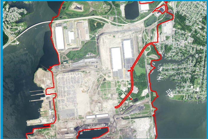
An aerial view of the Sparrows Point Site in 2018.

The Sparrows Point Site, a 3,100-acre peninsula reaching into the Baltimore Harbor in Baltimore County, Maryland, was home to one of the world’s largest steel manufacturing operations for more than 100 years. Steel manufacturing created thousands of jobs, but also resulted in significant contamination at the facility and in offshore areas. Beginning in the mid-1990s, the EPA and the Maryland Department of the Environment (MDE) were actively involved in addressing the contamination under RCRA. A variety of owners and operators were also involved through judicial and bankruptcy proceedings.