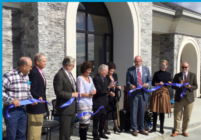
In October 2018, EPA Region 6 presented their Excellence in Site Reuse Award to ECOFHC and the City.

The Eagle-Picher Smelting facility operated as a zinc smelter from 1916 to 1968. In 1974, Eagle-Picher Industries donated the former smelter facility to the city of Henryetta, Oklahoma (the City). Although Eagle-Picher demolished most of the production buildings, the slag and cinder piles remained. Between 1996 and 1997, the EPA conducted removal and remedial actions at the site, which ultimately resulted in an Administrative Order on Consent (AOC) between the EPA, Oklahoma Department of Environmental Quality, and the City.