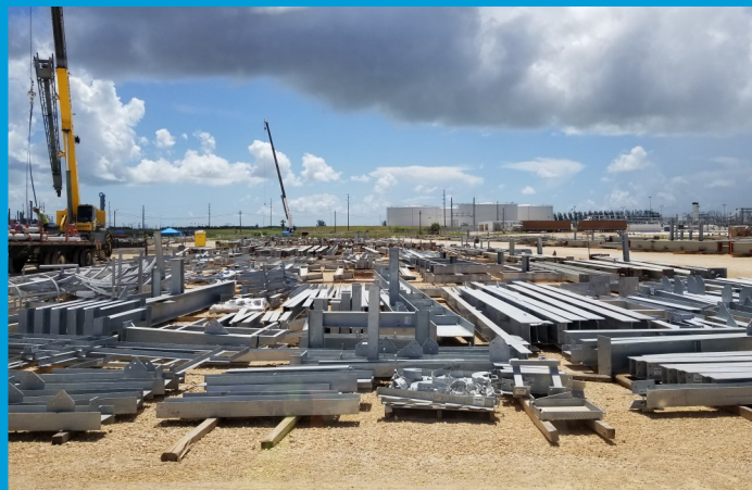
An on-site storage and laydown facility.

The 140-acre Tex Tin Corp. Superfund site is located near the banks of Galveston Bay in Texas City, Texas. Historical smelting operations contaminated soil, sediment and groundwater with hazardous chemicals. Cleanup at the site addressed contaminated groundwater, soil and sediment, waste piles, wastewater treatment ponds, acid ponds and slag piles. After cleanup, the EPA awarded the site a Superfund Redevelopment Program grant in 2001.