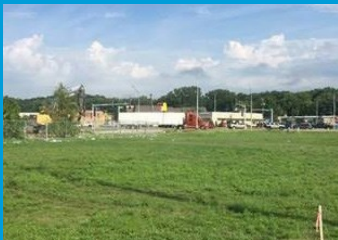
A view of the Armour Road site.

The 1.8-acre Armour Road Superfund site is located in North Kansas City, Missouri. From 1929 to 1986, an herbicide-blending facility operated on the site and resulted in arsenic contamination in the soil and groundwater. The site was referred to the EPA in 1996 and the Agency conducted a non-time critical removal to excavate and dispose of contaminated soil. The remedial action at the site has been expedited by coordination between the EPA and the PRP. For example, the EPA issued comfort letters to North Kansas City and prospective businesses. These comfort letters informed interested parties on the status of the site, including how the site can and cannot be reused. Today, the former industrial area is growing into a mixed-use urban center filled with hotels, apartments, restaurants, and a medical center. Coordination on the redevelopment of this property has been most recently recognized in a ceremony whereby the Regional Administrator presented Leading Environmentalism and Forwarding Sustainability (L.E.A.F.S.) Awards to the Mayor of North Kansas City and others committed to sustainable development.