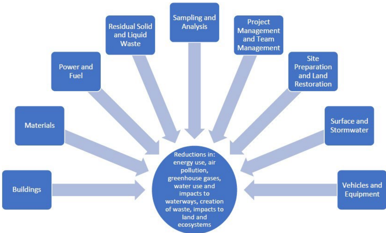
Figure 1 – Boxes represent each cleanup activity category in the ASTM Standard Guide. Implementation of BMPs from these categories directly affects the Core Elements of EPA's Principles for Greener Cleanups in the center circle.

The PCB Program regularly requires cleanup completion reports to document compliance with the PCB cleanup approval and regulations. ASTM guidance on reporting Greener Cleanups recommends documenting Greener Cleanup BMPs in a completion report. EPA reviewed 50 PCB cleanup completion reports documenting Greener Cleanup BMPs since 2015. EPA analysis found that BMPs from the Standard Guide have been implemented from all cleanup categories to address all core elements of EPA's Principles for Greener Cleanups, as shown below. Case studies highlighting some PCB Greener Cleanups follow, as well as a list of 22 frequently used BMPs at PCB Cleanups.