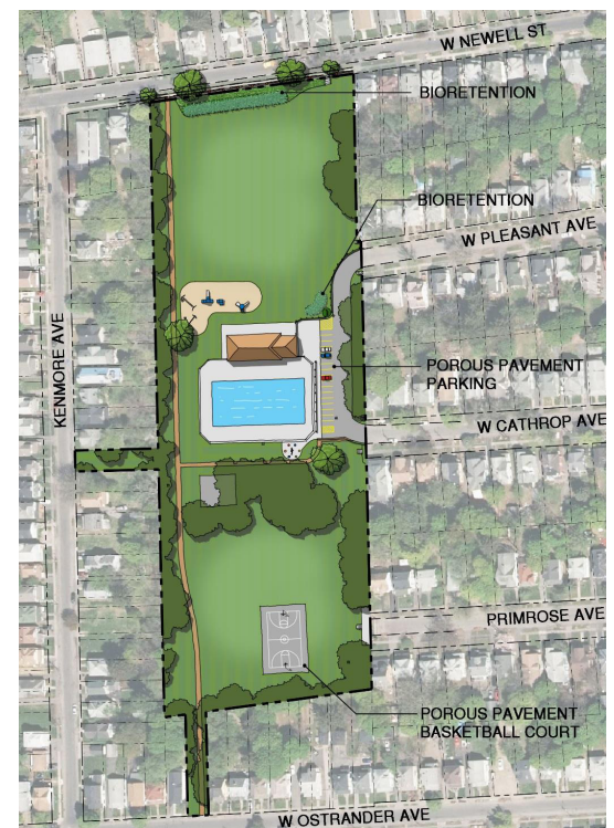
McKinley Park.

To enhance McKinley Park's sports equipment, the project received a grant from the Jim and Juli Boeheim Foundation's Courts4Kids Program, which provides funding for renovation of outdoor community basketball courts. It focuses on socio-economically disadvantaged areas around Syracuse and the surrounding region to give children the opportunity for healthy activities and improved play spaces. Courts4Kids provided the basketball hoops, benches, and other equipment that was not directly contributing to the green infrastructure effort.