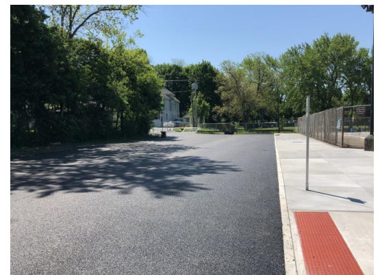
The new, porous parking lot.