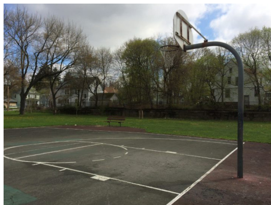
The old, half-court basketball court before the project.

The project faced a few obstacles before it was completed. For example, the utility survey did not pick up some electrical