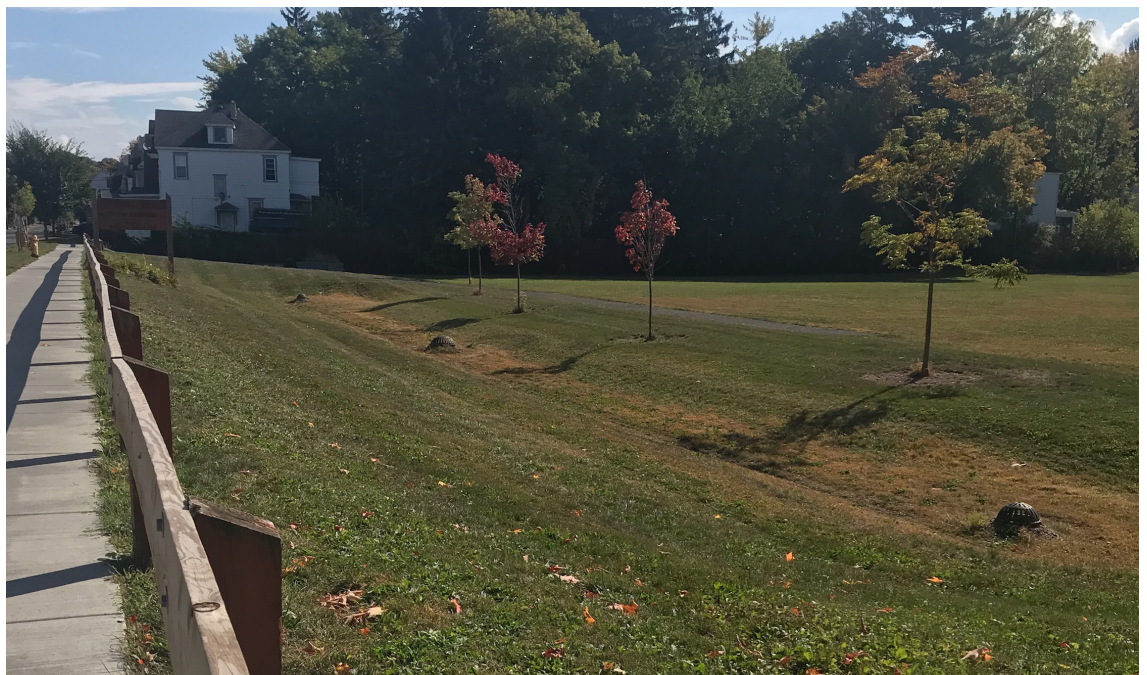
Plantings in the bioretention area on the North side of the park.

In addition to improving stormwater management of the area, this project has enhanced McKinley Park through increased green space. The park once had tennis courts, but they were in