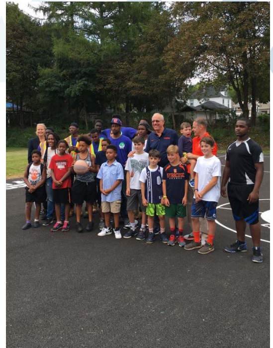
Local children and Courts4Kids representatives celebrate the new full-court space.

during a time of year when plants are more likely to take root in that region. The plantings at McKinley Park were installed in the summer, so they took a little longer to become established due to harsh weather conditions.