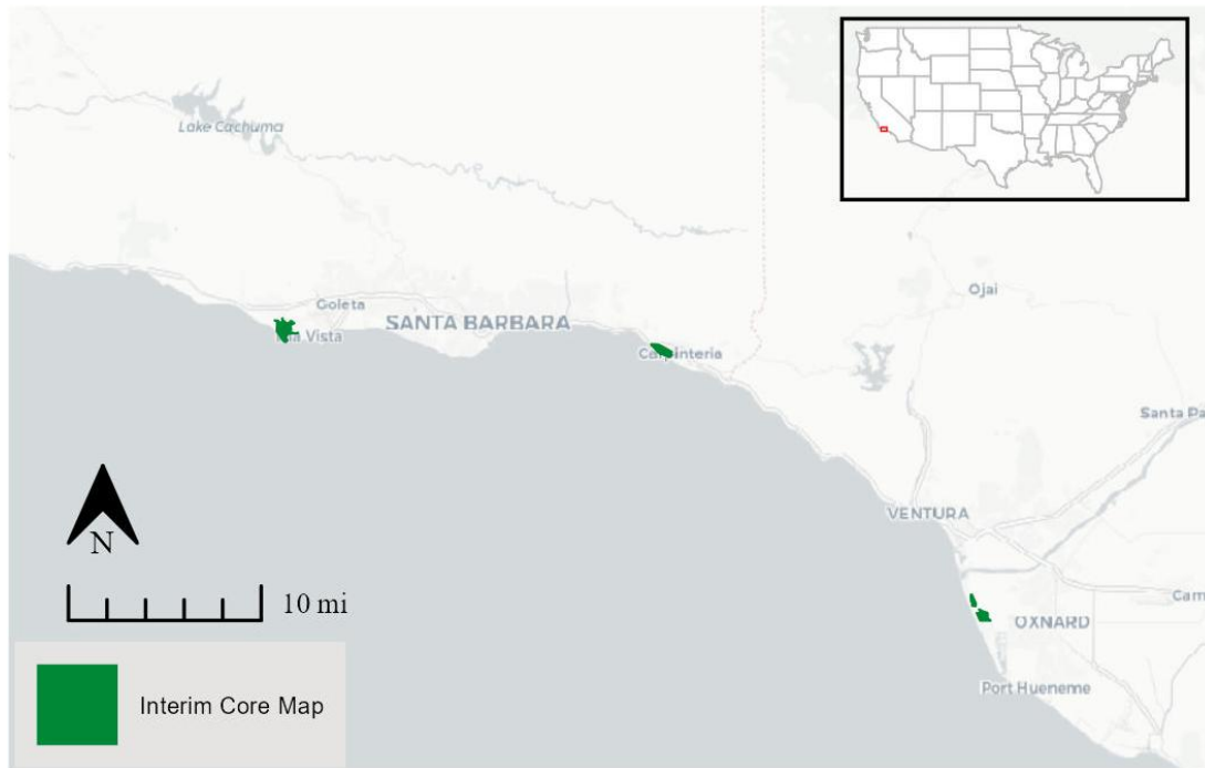
Figure 1. Interim core map for Ventura Marsh Milk-vetch.