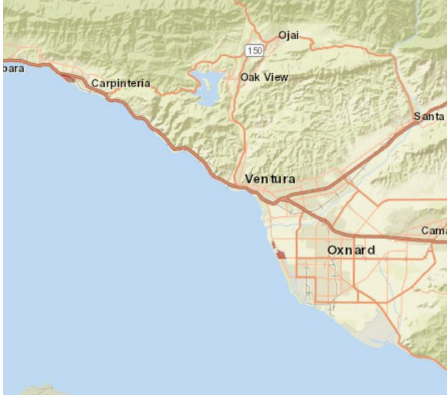
Figure A1-2. Figure of the Ventura marsh milk-vetch's designated critical habitat.