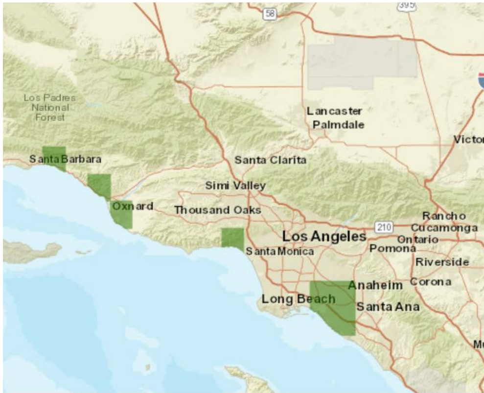
Figure A1-1. Figure of range map for the Ventura marsh milk-vetch from ECOS – 251,438 acres